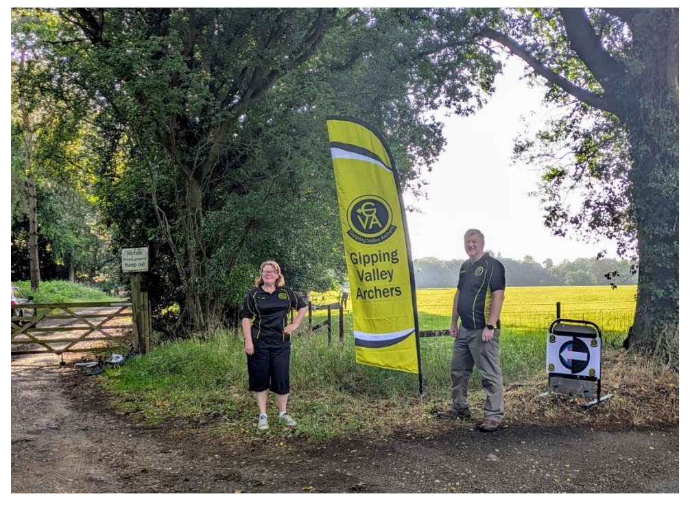
A lot more photos were posted on the main GVA WhatsApp group